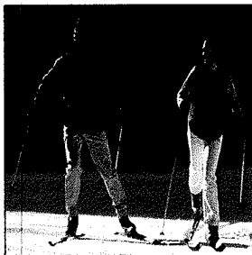
Cross Country Skiing

For more information and to express interest, contact Jane Ham at jham@themha.org or call 800-546-4090 .