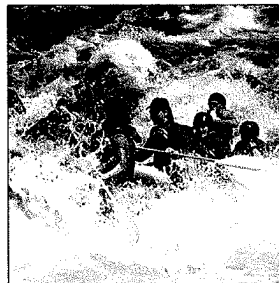
White Water Rafting