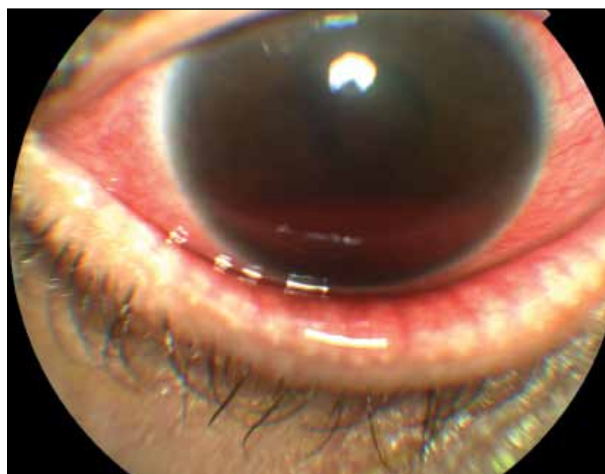
Figure 1. Traumatic hyphema.

Because a rebleed in hyphema can often be more significant than the initial bleed, patients require close observation, especially from days 2 to 5 after the trauma. Although, historically, patients were admitted to the hospital for bed rest and close monitoring, a recent retrospective study with historic controls of 154 patients by Shiuey and Lucarelli found comparable outcomes with outpatient management 3 ; rebleeding rates were 4.5% in the outpatient group versus 5% in the inpatient group, and