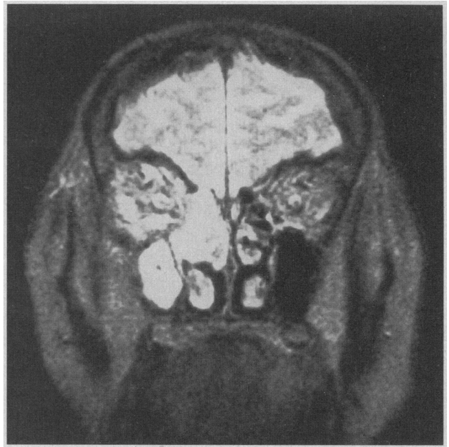
Fig 2.—Magnetic resonance imaging of the head showing right-sided maxillary and ethmoidal sinusitis. The high signal intensity on T2 imaging is suggestive of an inflammatory process.

the patient may present with proptosis, ophthalmoplegia, eyelid edema, chemosis, and possibly visual loss.